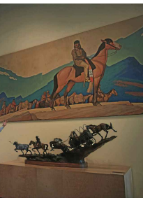
Museum of the West's sculpture courtyard