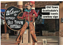
Old Town Scottsdale's iconic cowboy sign

The majesty and scope of the West can be seen in traditional paintings such as the one of a Hopi woman atop her horse gazing at the horizon and a less traditional painting of a tuxedo-clad pianist sitting atop a mesa, playing his piano and staring at the same expansive view. For a different take on the majesty