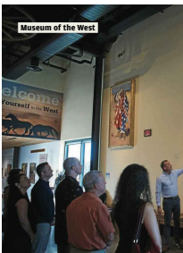
Museum of the West