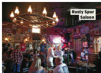
Rusty Spur Saloon