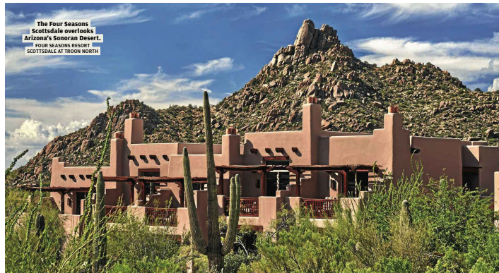
The Four Seasons Scottsdale overlooks Arizona's Sonoran Desert. THE FOUR SEASONS RESORT IN SCOTTSDALE AT TROON NORTH