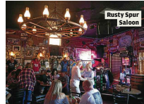
Rusty Spur Saloon