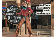
Old Town Scottsdale's iconic cowboy sign