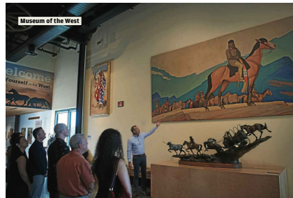
Museum of the West