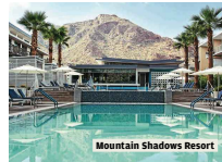
Mountain Shadows Resort

esty of the West, book a tour at Frank Lloyd Wright's Taliesin West, a counterpart to the architect's Wisconsin Taliesin.