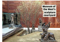
Museum of the West's sculpture courtyard