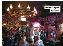
Rusty Spur Saloon