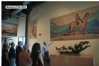
Museum of the West