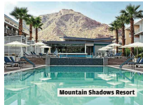
Mountain Shadows Resort