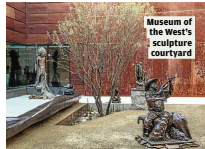
Museum of the West's sculpture courtyard