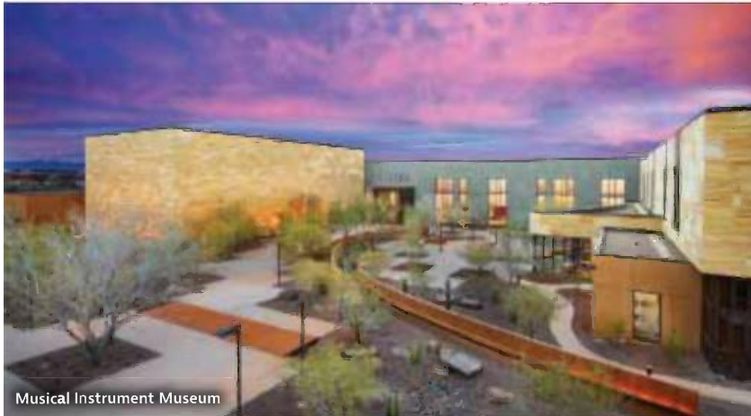
Musical Instrument Museum