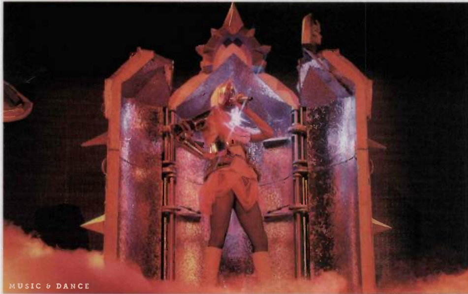
MUSIC & DANCE