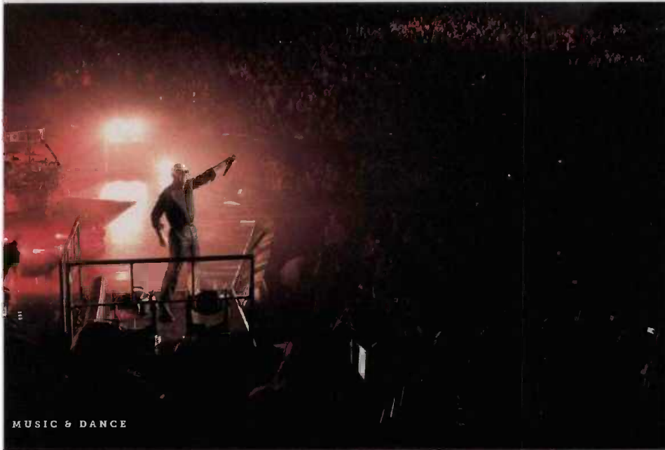
MUSIC & DANCE