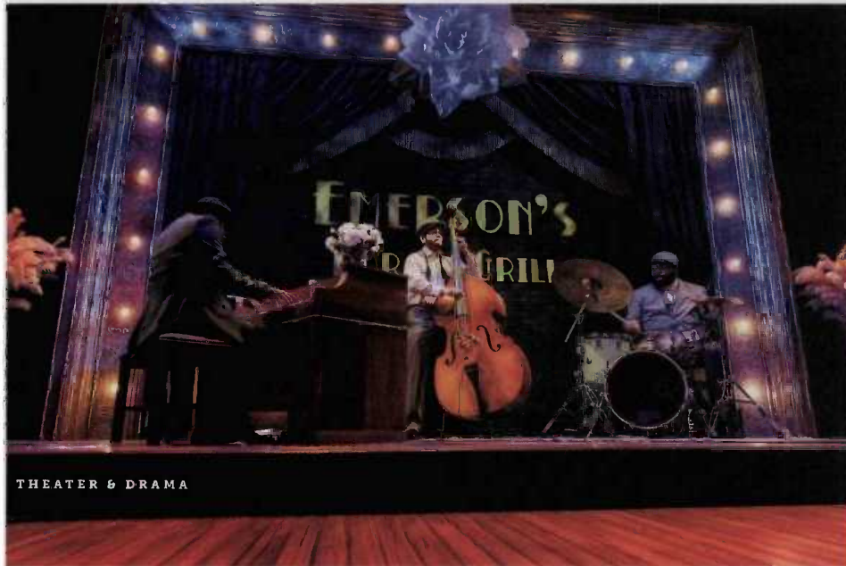
THEATER & DRAMA