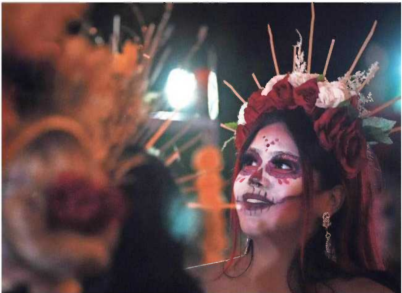
Las Catrinas Pageant showcasing Mexican pin-up style and honoring Día de los Muertos on Oct. 29, 2022.

Reach the reporter at dina.kaur@arizonarepublic.com . Follow @dina_kaur on X, formerly known as Twitter.