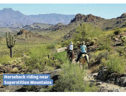
Horseback riding near Superstition Mountains

Food scene: It's always patio season in the desert. Take your pick of twinkly-lit courtyards under shady trees, and canal-side decks lined with cactuses and do what patios do best: brunch. Early mornings are a glorious time to visit the Desert Botanical Gardens, and its in-house restaurant Gertrude's is great for bread pudding French toast and Hatch chile tostadas. Taking you from morning to night is Sip Coffee & Beer Garage, a stylish neighborhood cafe in a former oil change station with