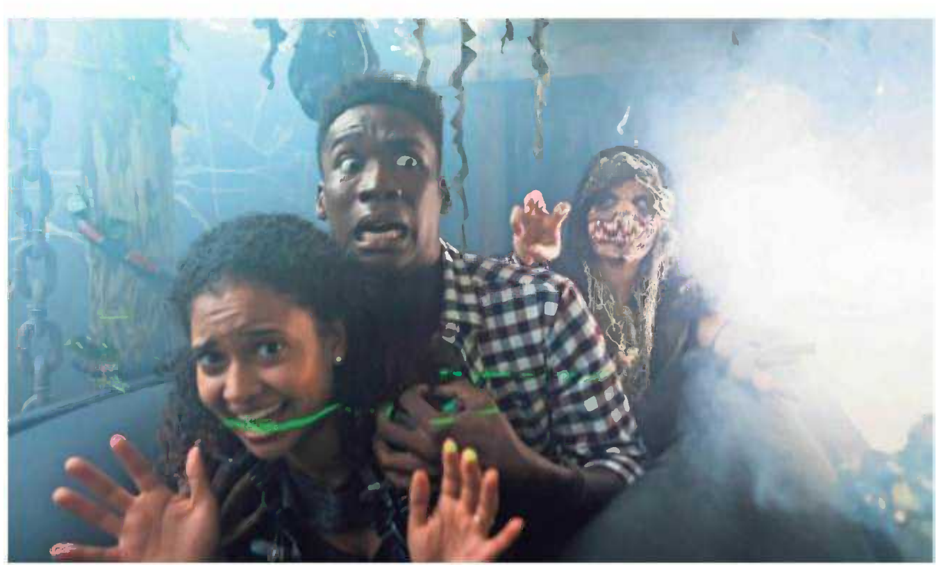
There are loads of truly frightful events around metro Phoenix that can give you the scare that you crave for the Halloween season.