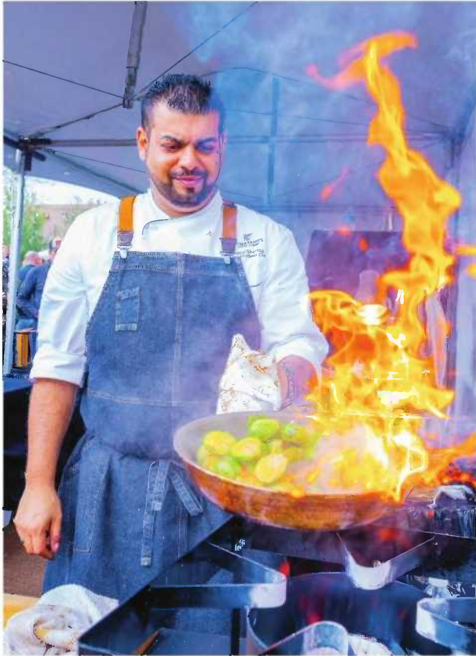
The 15th annual Devour Culinary Classic returns to Phoenix Feb. 24-25.