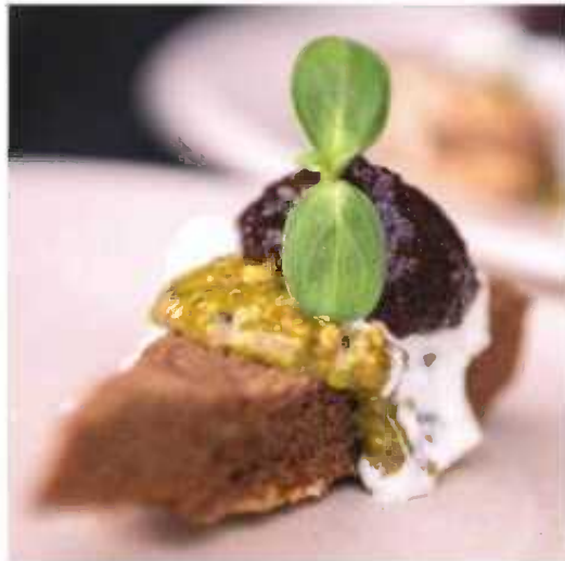
Desert Botanical Garden and Southern Arizona Arts and Culture Alliance are partnering with Local First Arizona to assemble the most creative chefs, sommeliers, cicerones and other food and drink purveyors.